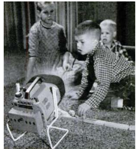
REAR-MOUNTED POWER PACK permits viewing anywhere. It goes to picnics, the beach, or the family car

To make the bracket, impress heavy gauge wire or several strands of wire solder round the bottom of